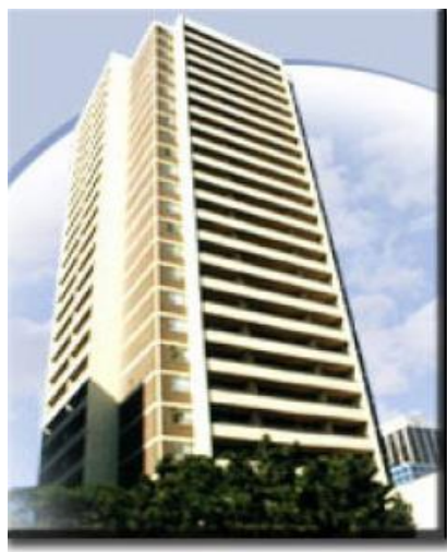
Town Inn Suites