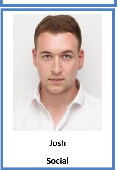
Who should you see about.....?