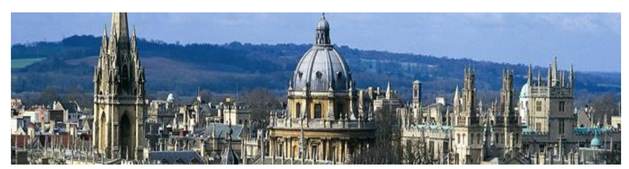
Dreaming of Oxford – immerse yourself in a world renowned university city.

Our newly refurbished school in the centre of Oxford is the perfect place to study and explore traditional British culture and heritage. After class, you'll soon discover a wide range of opportunities as you join a community of 30,000 students.