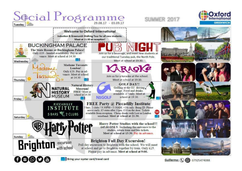
Sample Social Programme

And don't forget our famous Boat Parties!