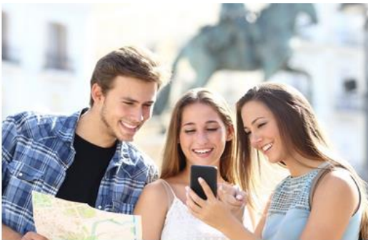
ENGLISH FOR BEGINNERS