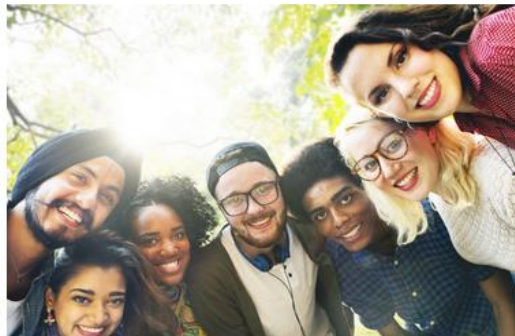
GENERAL ENGLISH A1 - A2