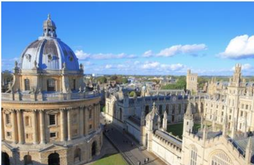
WELCOME TO OXFORD INTERNATIONAL OXFORD