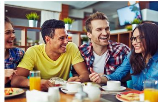
GENERAL ENGLISH B1 - B2