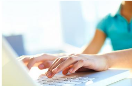
OXFORD INTERNATIONAL PLACEMENT TEST