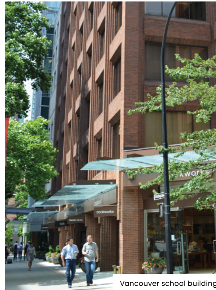
Vancouver school building