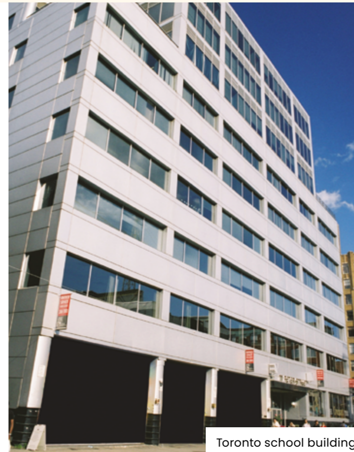
Toronto school building