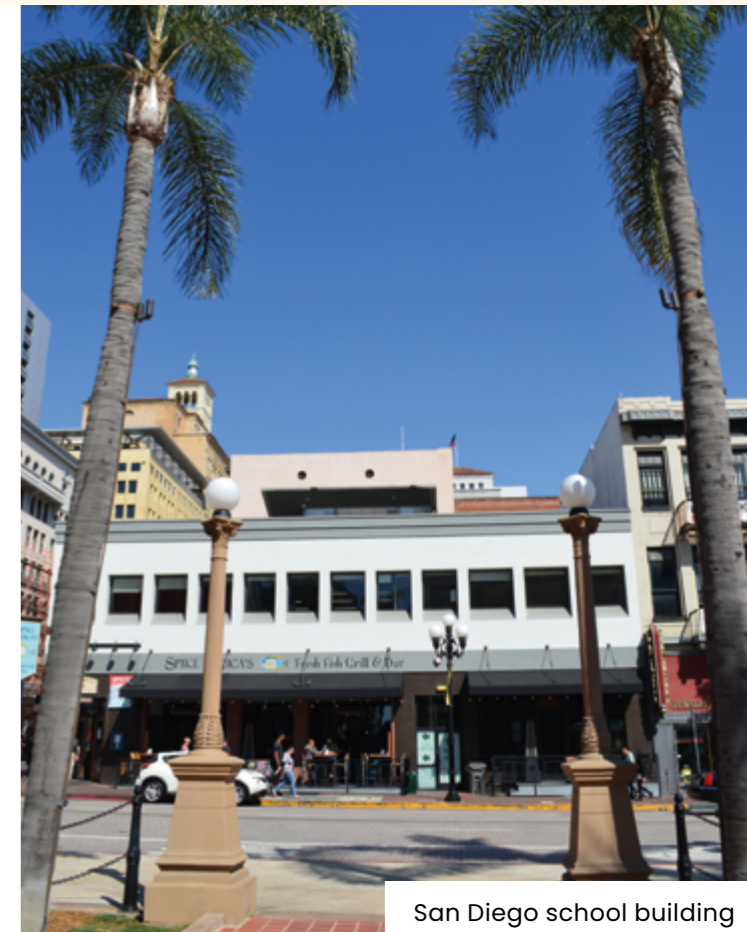
San Diego school building