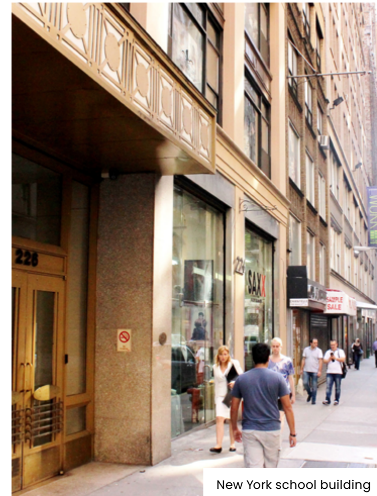
New York school building