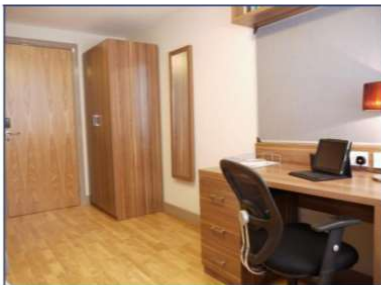
Britannia Study Hotel room