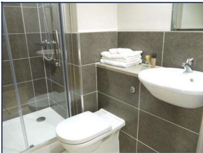
Britannia Study Hotel bathroom