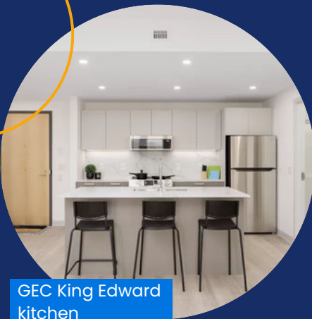
GEC King Edward kitchen

Two weeks' rent is to be paid during registrations and will be returned upon inspection of your room following your last day of school. Payment terms are dependent upon when you book and the length of your booking. Bookings require a minimum 5-week stay. Prices valid until 31 st December 2026. Prices may be adjusted at any time without notice. Please refer to terms & conditions on our website.