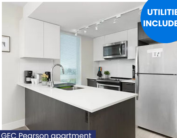
GEC Pearson apartment

GEC Living Student Residence offers 6 fantastic locations to choose from, all in the heart of metro Vancouver. With a variety of modern move-in ready apartments, students can enjoy comfortable living with easy access to the school and activities, restaurants, and shops Vancouver has to offer.